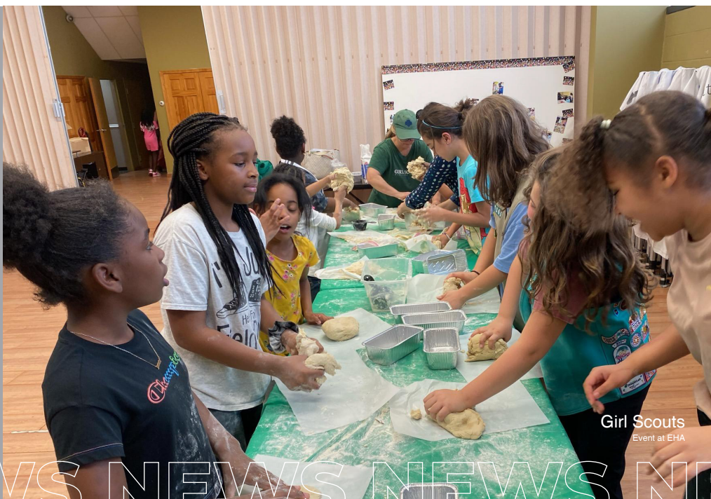
Girl Scouts Event at EHA